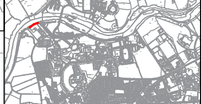
PLATE NO. 8